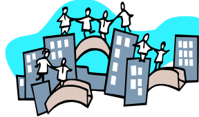
Community Law Night will be held on May 8, 2008 at the Hall of Justice—we appreciate your commitment to this program.