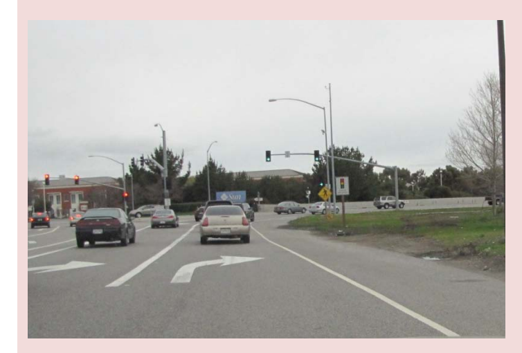
EB on Willow & Bayfront Exp.