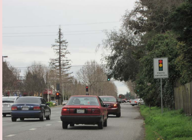
SB on El Camino & Valparaiso There are no cameras in the EB direction

PHOTO ENFORCED Warning Signs Used In Menio Park tend to be in the far right hand lane and some distance from the intersection.