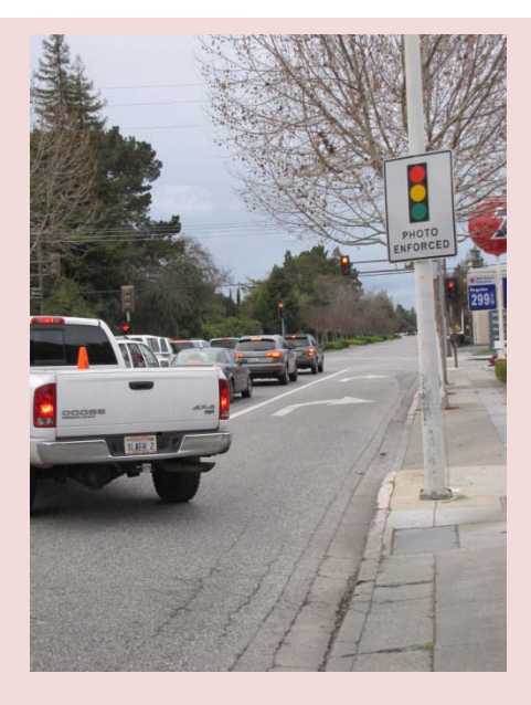
NB on El Camino & Glenwood