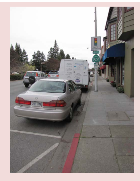
SB on El Camino at Menlo