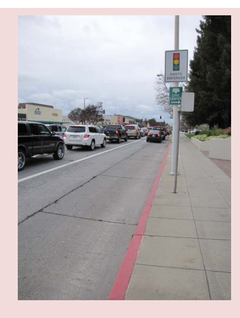
NB on El Camino at Ravenswood