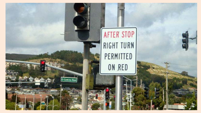
This warning to stop before turning right is located on southbound El Camino Real