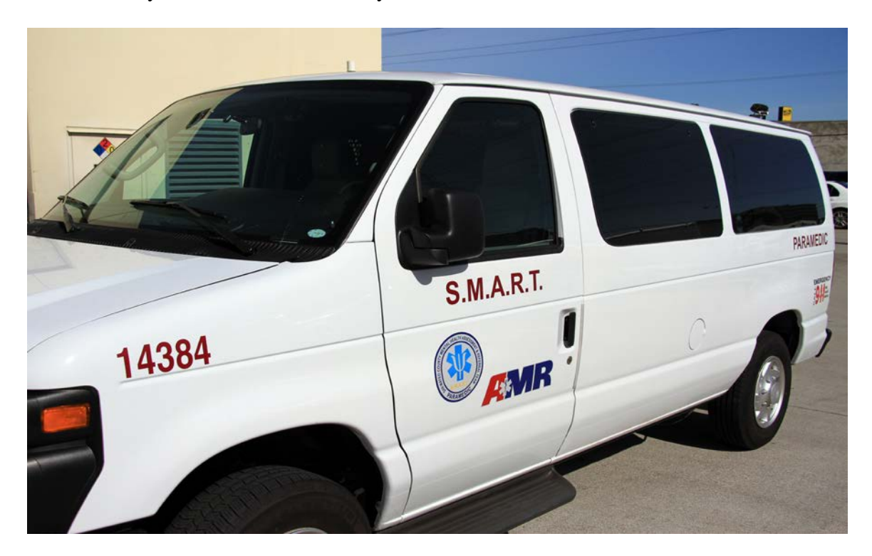
Figure 2. A San Mateo SMART Car

A SMART team consists of two specially trained emergency medical staff who arrive on the scene in a modified SUV-type vehicle (see Figure 2). Unlike a regular ambulance, the SMART car is not equipped with lights and sirens, so its arrival will always be comparatively discreet. American Medical Response, with headquarters in Burlingame, operates ambulances for San Mateo County and oversees the County's two SMART cars.